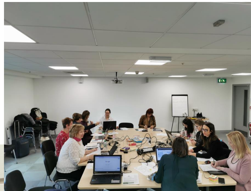
Belgium Slovakia Cyprus Hungary